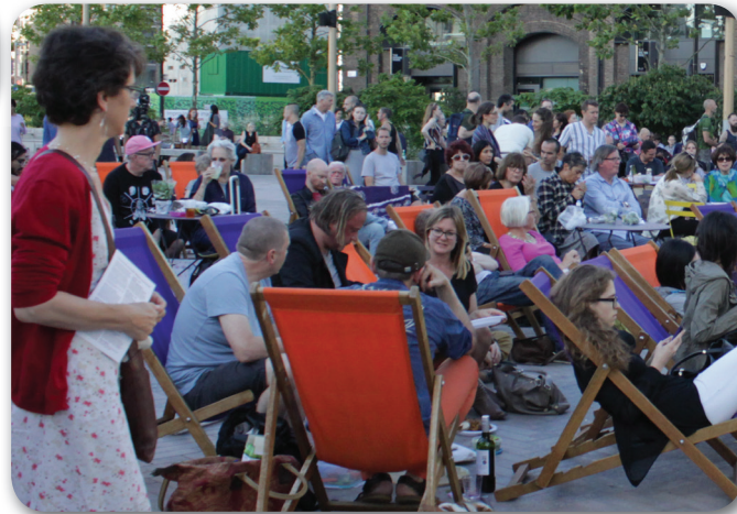
Cubitt Sessions. 2016

When violence breaks out on an urban street a young woman is forced to flee her home. Unable to return the following day she embarks on a perilous journey that sees her cross the line from citizen to refugee. Road Memoir is a dramatic, moving and innovative twelve-episode podcast opera.