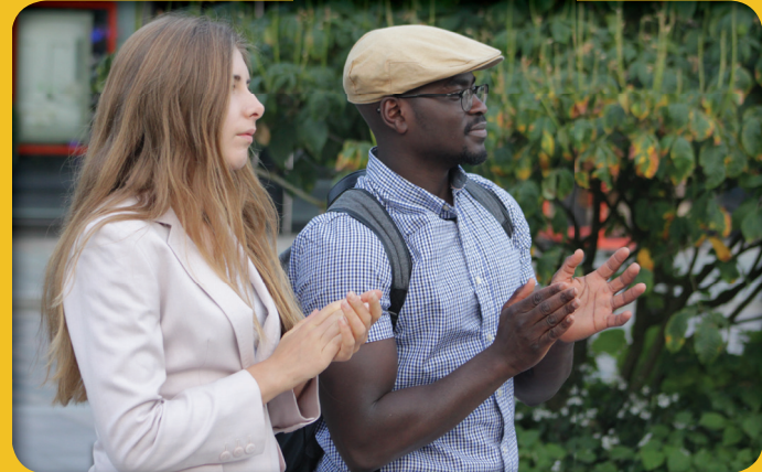
Cubitt Sessions, 2016