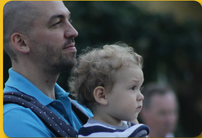
Cubitt Sessions, 2016

To celebrate 20 years of producing surprises and delights, the company brings its own surprise performance, specially created for this one evening. Expect laughter, joy, glorious music, brilliant work and Tête à Tête's hallmark theatricality.